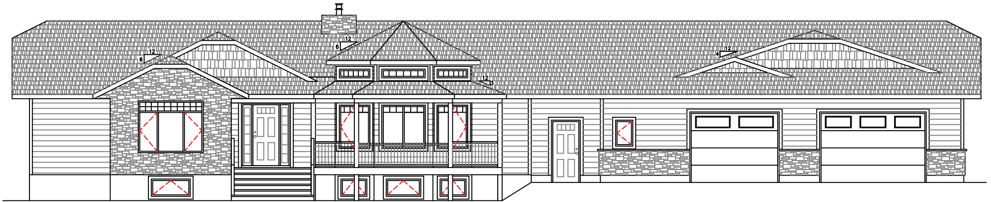
CYPRESS FRONT ELEVATION