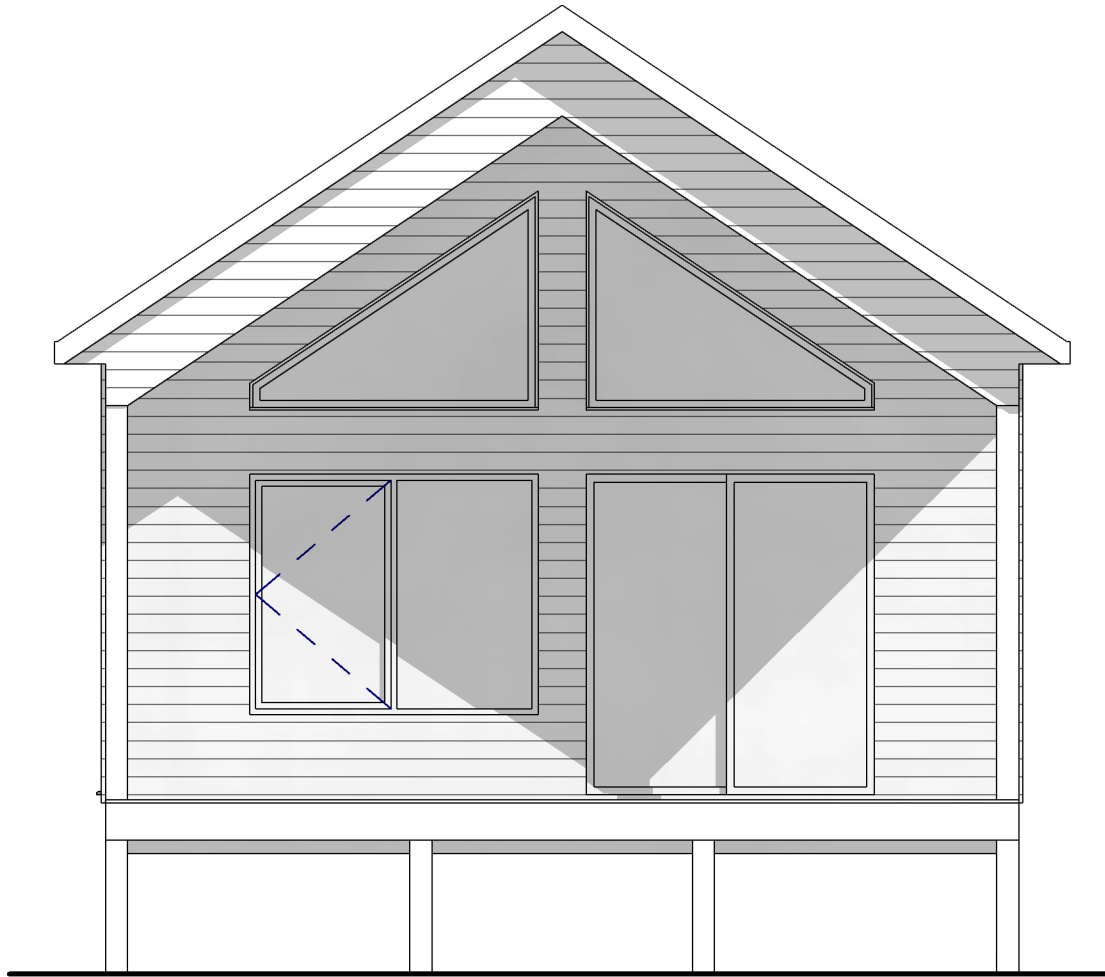
FRONT ELEVATION PRELIM SCALE 1/4" = 1'-0"